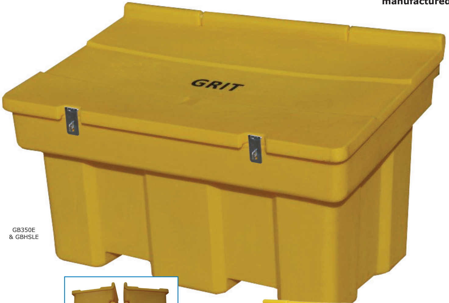
GB350E & GBHSLE