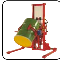
Available with side-tilting forks and/or optional extras, e.g. drum turner, remote control, level control, crane arm.