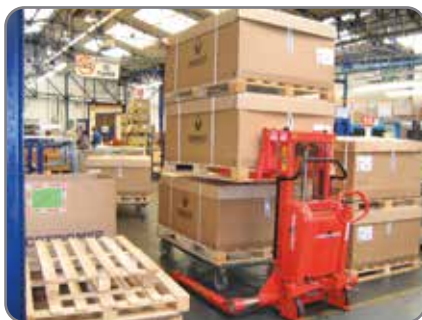
Strong construction ensures a long operating life and low maintenance costs.