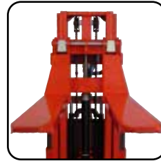
Adjustable forks are available in many different lengths and types.