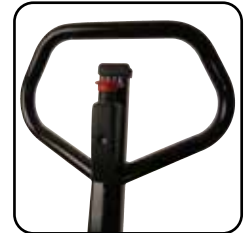
Ergonomic handle ensures the user a relaxed hold. The handle can be marked with the name/department.

Available with manual and electric lifting.